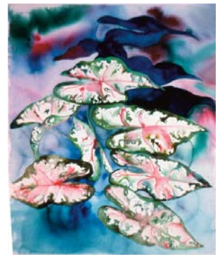
Caladiums, 30 x 22 watercolor

My work is a magical personal vision of our world.