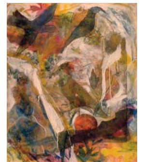
Reverie, 40 x 30 monoprint./mixed media