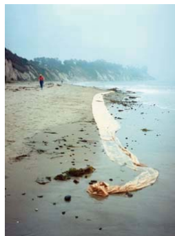
Hendry's Beach walk, Santa Barbara, CA