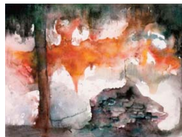
Passages IV, 30 x 22 watercolor