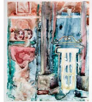
Faded Memories, 18 x 12 watercolor monotype