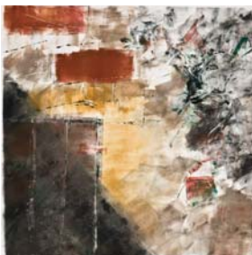
I Strati Esterni XVI, 18 x 18 oil monotype