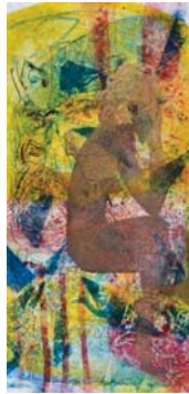
Feminine Mystique I, 32 x 12 Monoprint/mixed media

I have lived, taught and made art in Florence, Italy; Brno, Czech Republic; and Çatalhöyük, Turkey, and have presented numerous papers, lectures and workshops at international conferences. Now retired from my academic career, making art is once again my full time occupation. My newest project is MomiLani Paper Arts, an instructional art space at 17th Avenue Studios offering classes in printmaking, papermaking, books arts, collage and imagination expansion.