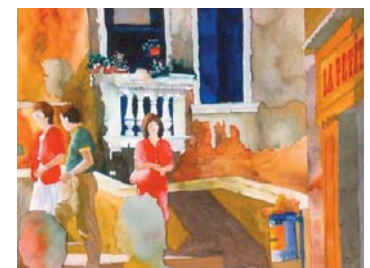
Autoritratto, 40 x 30 watercolor