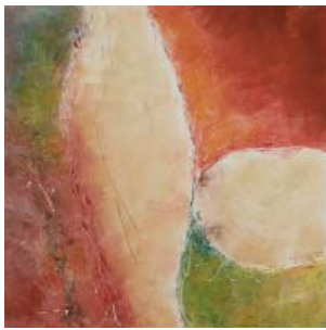
Gli Interni Profundi I, 24 x 24 oil monotype